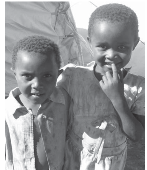
Children in Naivasha, Kenya, served by Upendo Village.

The evening begins with the sharing of a simple meal, and is followed by prayer, engaging presentations, and table dialogue. The presenters are Wheaton Franciscans and guests who are dedicated to making connections between Franciscan Spirituality and the issues and problems currently facing our society.